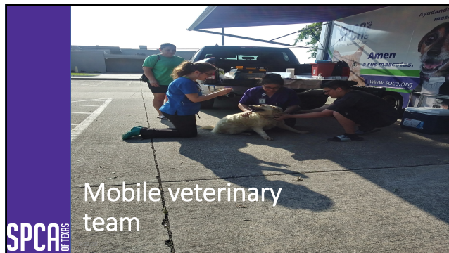
Mobile veterinary team